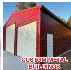
CUSTOM METAL BUILDINGS

200 Rodeo Dr., Moscow, ID 208-268-8881 • www.BylerSales.com