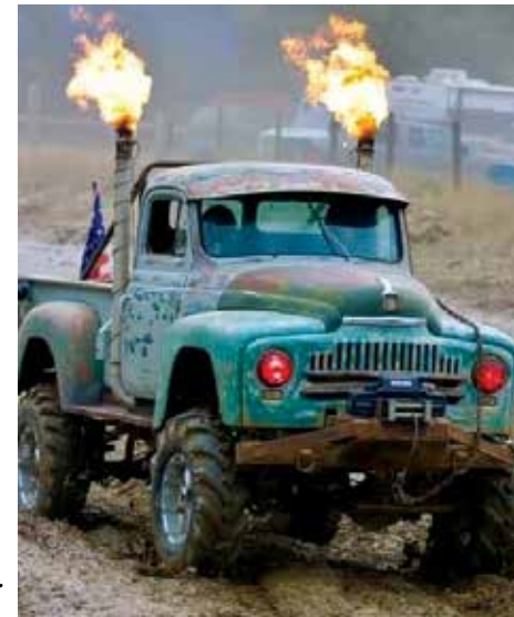
Rigs of all kinds are welcome Nov. 2 at the next edition of mud bogs at Northport International Raceway.

Further information is available at Northport's Facebook page.