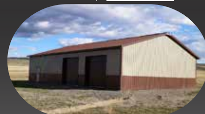
40 x 60 x 12 | $6,000 Discount