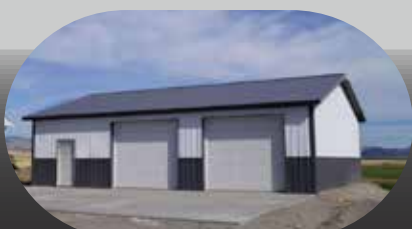
30 x 40 x 10 | $3,750 Discount