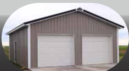
24 x 32 x 10 | $3,000 Discount

-MQS BUILDINGS ARE INSTALLED BUILDINGS ONLY -NO KITS AVAILABLE -DISCOUNTS MAY VARY