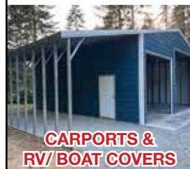
CARPORTS & RV/BOAT COVERS

Portable Storage Sheds Horse Shelters • Utility Sheds Barns & Shops • Chicken Coops • Metal Roofs & Siding • Tiny Houses & More!