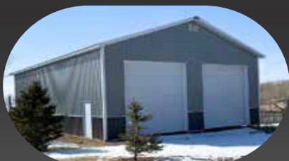
30 x 48 x 16 | $5,000 Discount

Contact Us: 855-677-2276 www.MQSBARN.com