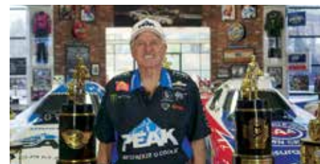
Drag racing legend John Force looks to return to the track as soon as possible following suffering a Traumatic Brain Injury in a crash at Richmond, Virginia in June.