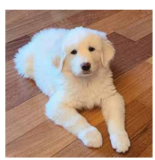
GREAT PYRENEES PUP- PIES

Available January 16, males & females available, brindle & fawn with flash. Tails, shots & dewormed, health guarantee, parents on site, pet price, $1500. Call/text, 208-791-6068 Lewiston